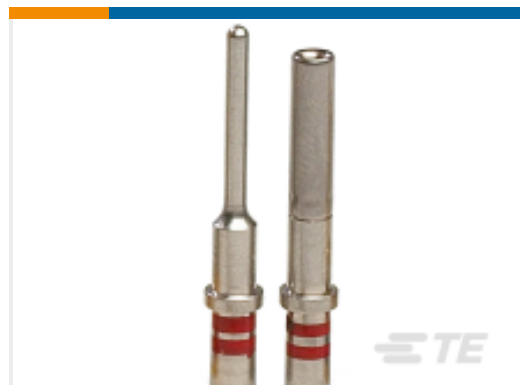
TE Part #ZPF000000000001261 097-0267-16 A1267