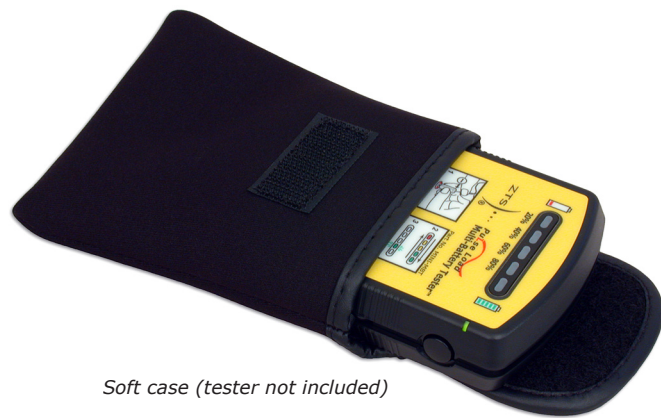
Soft case (tester not included)