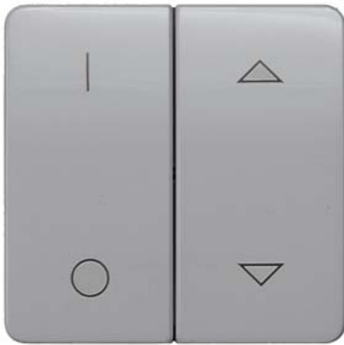
DELTA PROFIL, SILVER ROCKER M.SYMBOLS I0 A.SHUTTER FOR SHUTTER SWITCH, 65X65MM