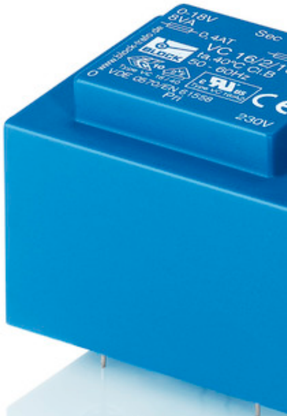
Picture shows VC 16/2/18