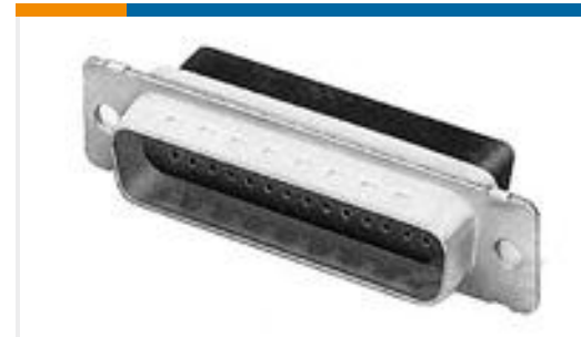
TE Part #1658672-1 HDP-22, PLUG, SIZE 3,44 POSN