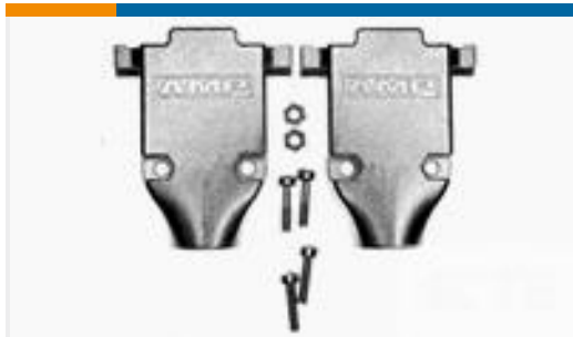
TE Part #1-5745172-3 AMPLI CBL CLMP KIT