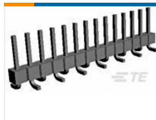
TE Part #1241150-4 4P MOD II BREAK AWAY HDR, SMD, BLISTER