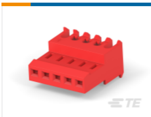
TE Part #1-641193-2 Nylon Gold Plated Receptacle: 2.54 mm, No Mating Alignment, MTA 100