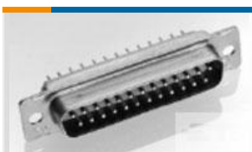
TE Part #204515-3 AMPLIMITE, ASY, PLUG, STD, 90, 2, KIT