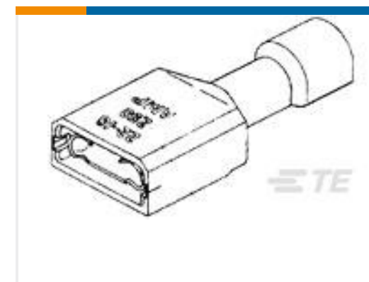
TE Part #2-520275-2 ULTRAFast 187 ASSY REC 22-18 TPBR LP