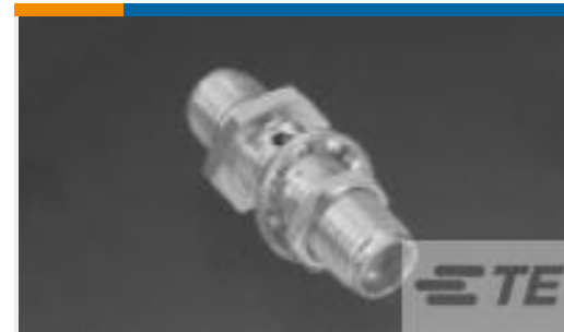
TE Part #1054881-1 2084 1900 02