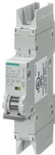
CIRCUIT BREAKER 10KA, 1POLE, D, 16A ACC. TO UL 489 - 277V