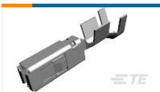
TE Part #1241396-3 AMP MCP 2.8K, CONTACT, SWS