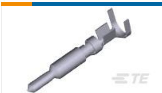
TE Part #1-770248-0 UMNL II PIN SN/AUNI/BR LP