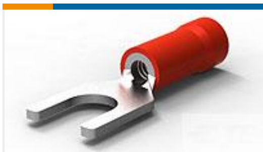
TE Part #165008 PLASTI-GRIP, SPADE 22-16 8