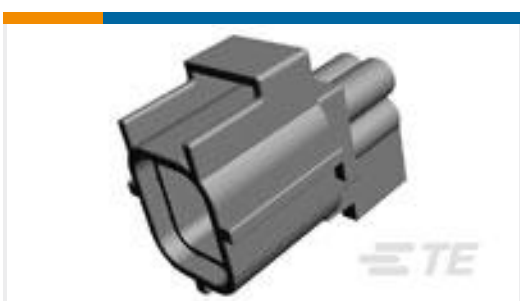
TE Part #184355-2 2X2 CAP ASSEMBLY, B KEY, GRAY,