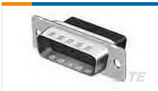
TE Part #207464-7 HDP-20,PLUG,SIZE 3, 25 POSN