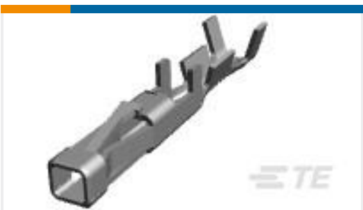
TE Part #1-794611-1 MICRO MNL RPT CNT,LS PC,15AU,L