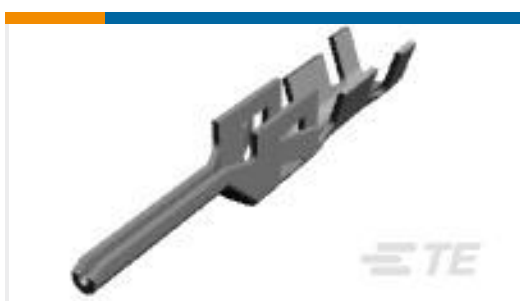
TE Part #1-794612-1 PIN CONT 20-24 15 GOLD L/P