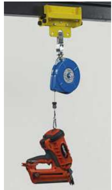
22F Model: Trolley with Nail Gun Application