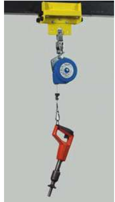
5F Model: Trolley with Tool Application

General Industrial | Electrical Tools | Mechanical Tools | Pneumatic Tools | Cabling and Hoses