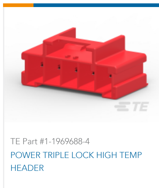
TE Part #1-1969688-4 POWER TRIPLE LOCK HIGH TEMP HEADER