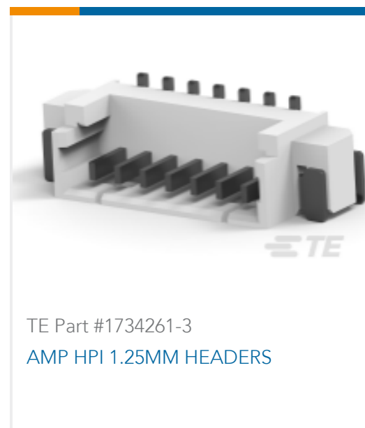
TE Part #1734261-3 AMP HPI 1.25MM HEADERS