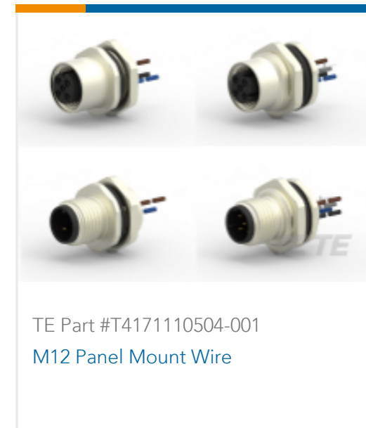
TE Part #T4171110504-001 M12 Panel Mount Wire