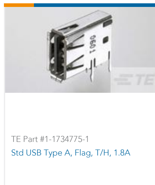
TE Part #1-1734775-1 Std USB Type A, Flag, T/H, 1.8A