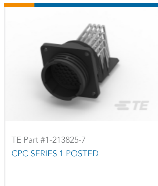
TE Part #1-213825-7 CPC SERIES 1 POSTED