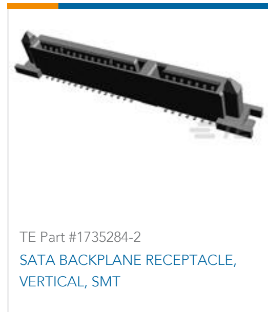
TE Part #1735284-2 SATA BACKPLANE RECEPTACLE, VERTICAL, SMT