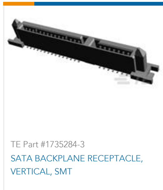
TE Part #1735284-3 SATA BACKPLANE RECEPTACLE, VERTICAL, SMT