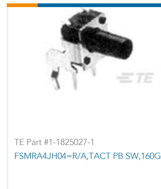
TE Part #1-1825027-1 FSMRA4JH04=R/A,TACT PB SW,160G