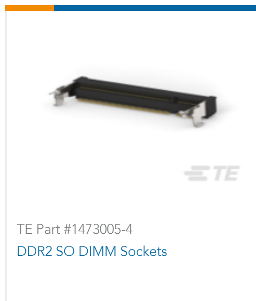
TE Part #1473005-4 DDR2 SO DIMM Sockets