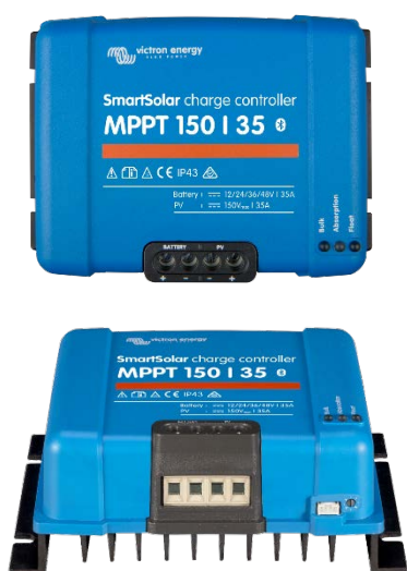
SmartSolar Charge Controller MPPT 150/35