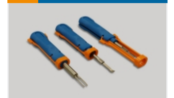
Insertion & Extraction Tools(18)