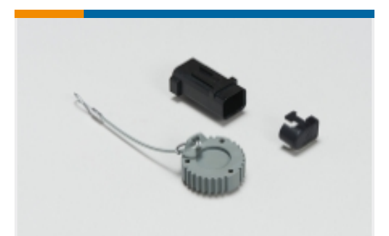
Automotive Connector Caps & Covers (10)