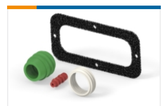
Connector Seals & Cavity Plugs(31)