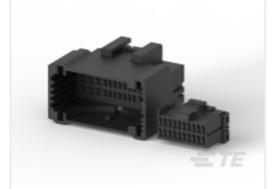
TE Part # CAT-M9194-CH8172 MULTILOCK, CONNECTOR HOUSING