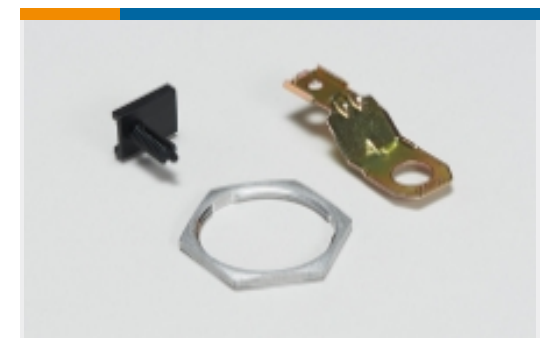
Other Automotive Connector Accessories(1)