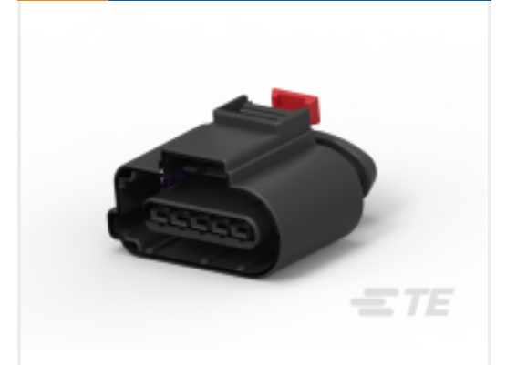
TE Part # CAT-AM705-CH8172 AMP MCP, SEALED CONNECTOR HOUSING