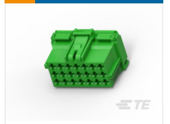
TE Part # CAT-AM705-CH8173 AMP MCP Unsealed Connector Housings