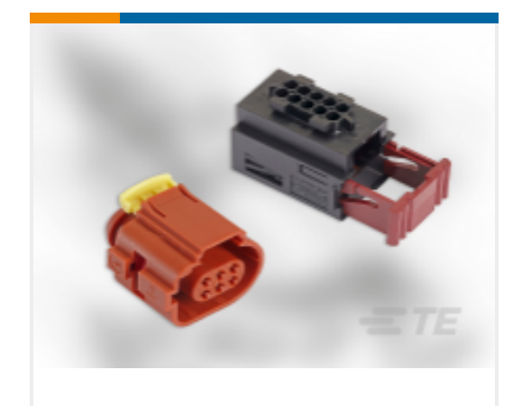
TE Part # CAT-T4827-CH8172 Timer Connector Housing