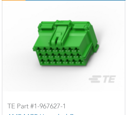
AMP MCP Unsealed Connector Housings