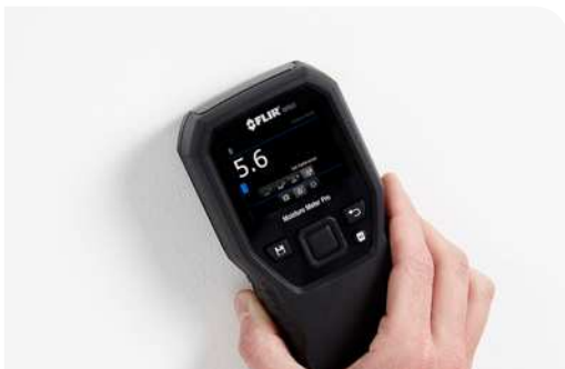
Verify moisture with pinless measurements