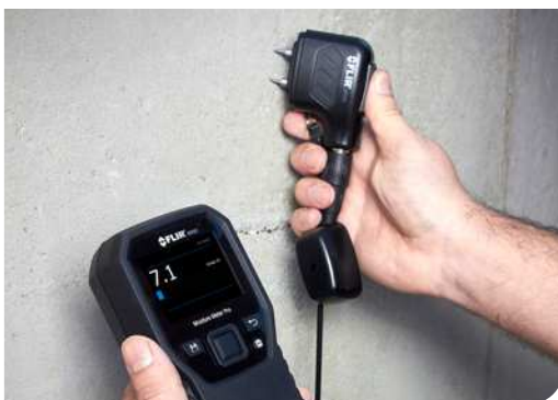
External pin probe for resistive moisture readings