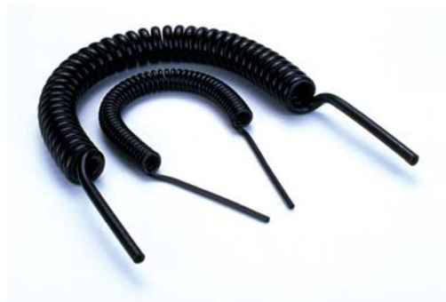
■ Tubing Size: Metric Size