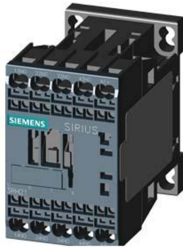
CONTACTOR RELAY, 4NO, DC 230V, SZ S00, SPRING-LOADED TERMINAL