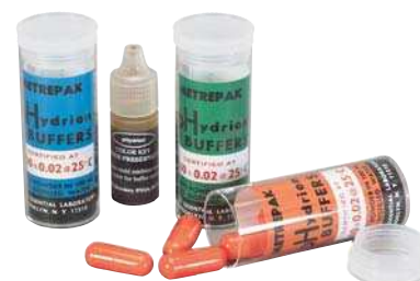
650470 pH 4, 7, and 10 buffer capsules with color key preservative