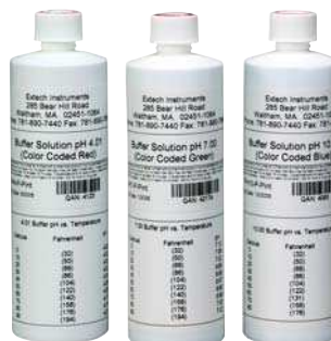
Pint size pH buffers for pH 4, 7, and 10 available (PH4-P, PH7-P, PH10-P)