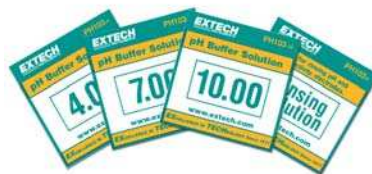
PH103 includes 6 pouches each of pH 4, pH 7, and pH 10 Buffers plus 2 Rinse solutions