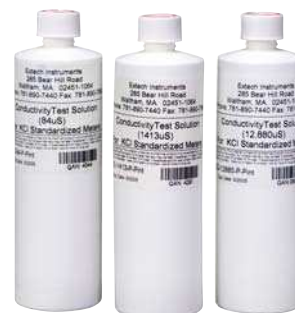
EC-84-P, EC-1413-P, and EC-12880-P pint size conductivity standards