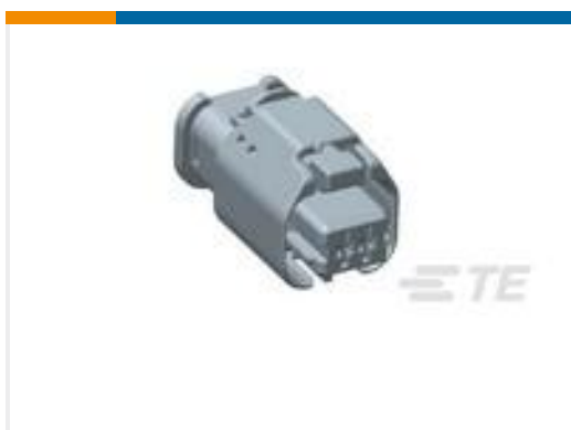
TE Part #1-1801175-6 2W RECEPTACLE HP CONNECTOR BROWN