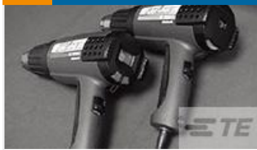
TE Part # CJ2087-000 HL2010E-KIT-120V