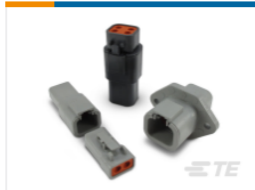
TE Part #DTP06-4S-C015 DEUTSCH DTP HOUSINGS