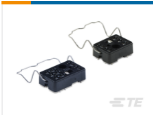
TE Part #1393824-1 CRADLE RELAY ACCESSORY