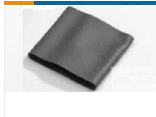
TE Part #137963J001 V2-1.5-0-SP-SM