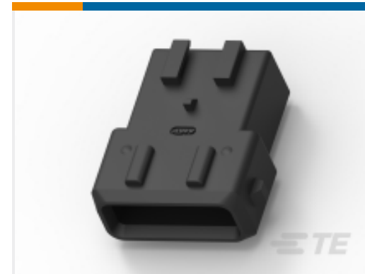
TE Part #1-144547-0 PL MIC4 ETAN 4 NOR