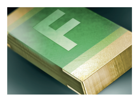
The tiny USF 1206 chip fuse protects electronic circuits simply and securely