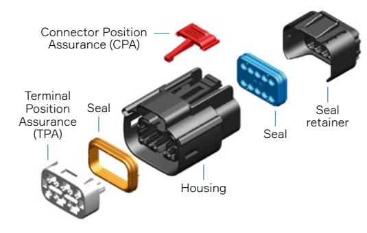
APEX® 150 Sealed 10W Female