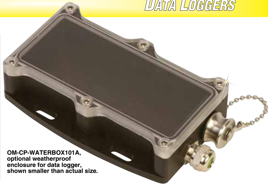
OM-CP-WATERBOX101A, optional weatherproof enclosure for data logger, shown smaller than actual size.

Password Protection: An optional password may be programmed into the device to restrict access to configuration options. Data may be read out without the password.