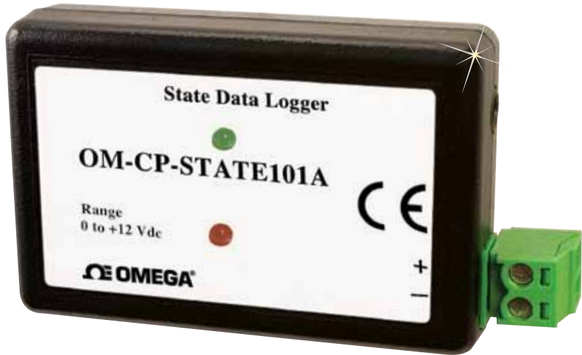
OM-CP-STATE101A shown larger than actual size.

The OM-CP-STATE101A is one of our newest data loggers. It is part of a new series of low cost, state-of-the-art data logging devices that has taken the lead in offering the most advanced, low cost, battery powered data loggers in the world today.