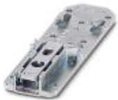
Universal DIN rail adapter