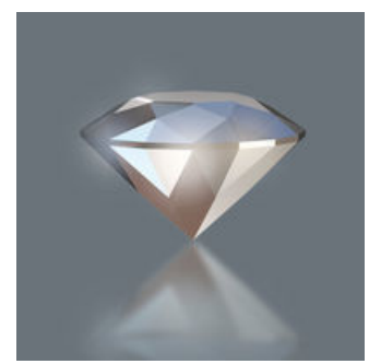
Another product advantage is the coating of the Impaktor bits with minute diamond particles.