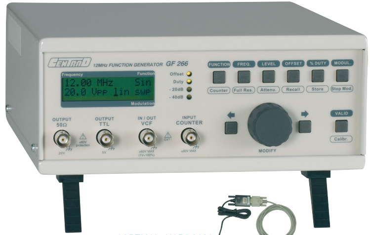
*OPTION : USBRS232

EASY : Storage for 14 setups and parameters.