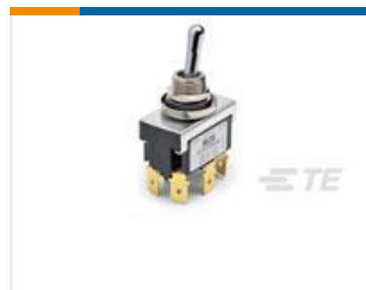
TE Model / Part # 7-6437630-2 AWTN1504 = POWER TOGGLE