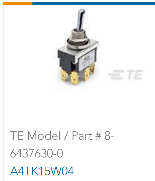
TE Model / Part # 8-6437630-0 A4TK15W04