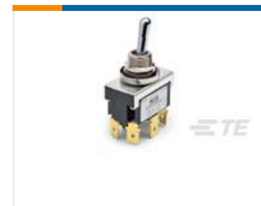
TE Model / Part # 7-6437630-0 AWTD1504 = POWER TOGGLE