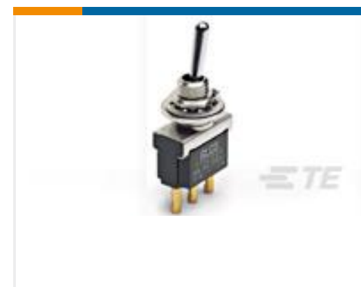
TE Model / Part # 3-6437630-5 F4TN0904=MINIATURE TOGGLE