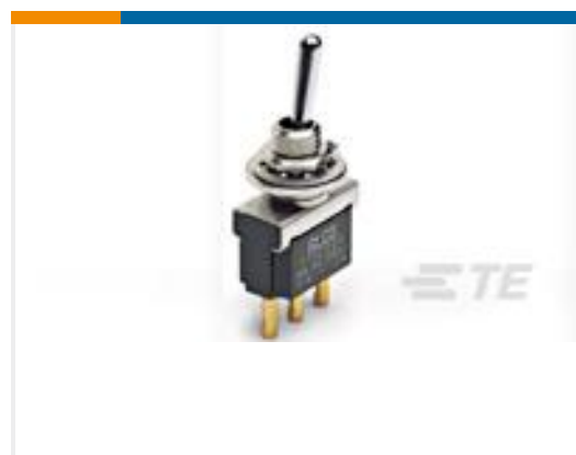
TE Model / Part # 2-6437630-0 FTD0904=MINIATURE TOGGLE