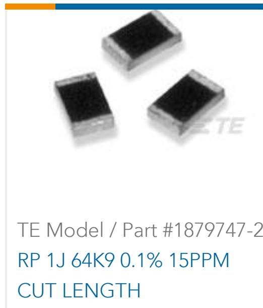
TE Model / Part #1879747-2 RP 1J 64K9 0.1% 15PPM CUT LENGTH