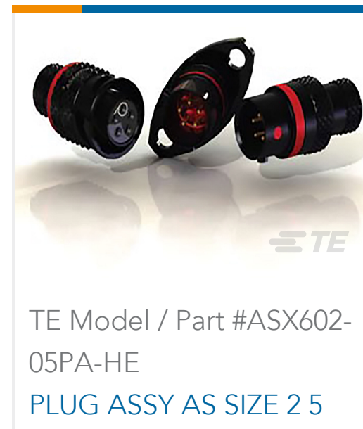
TE Model / Part #ASX602-05PA-HE PLUG ASSY AS SIZE 2 5 WAY