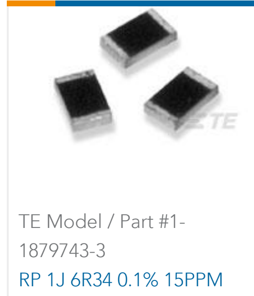
TE Model / Part #1-1879743-3 RP 1J 6R34 0.1% 15PPM CUT LENGTH