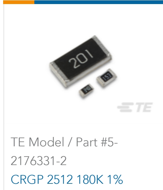
TE Model / Part #5-2176331-2 CRGP 2512 180K 1%