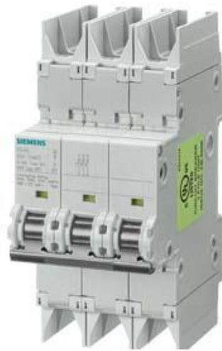
CIRCUIT BREAKER 10KA, 3POLE, C, 30A ACC. TO UL 489 - 480Y/277V