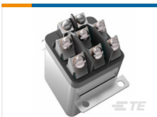
TE Part #1617807-5 FC-335-SY8= RELAY, 3PST