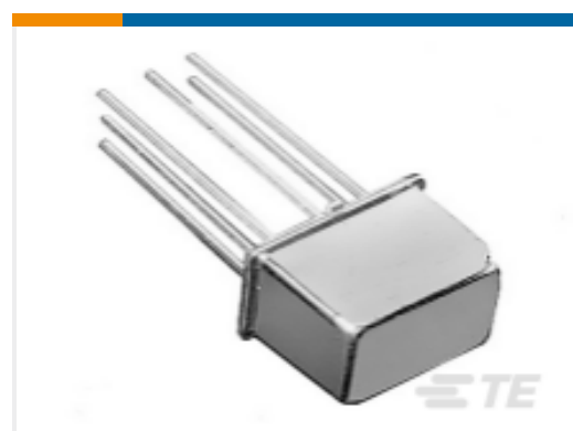
TE Part #1617147-5 JMGAP-26P = M39016/17-030P