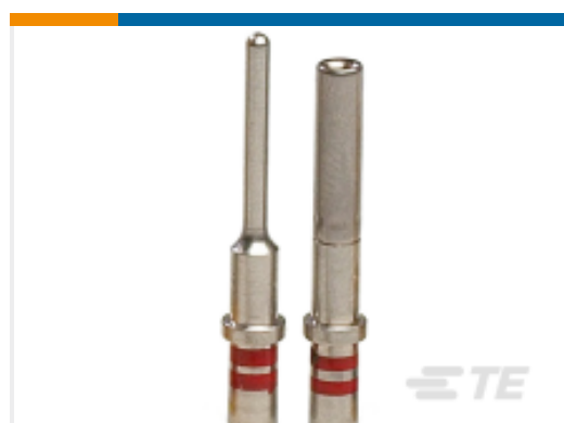
TE Part #ZPF000000000001261 097-0267-16 A1267