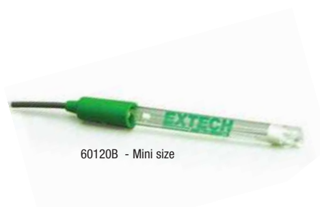
60120B - Mini size