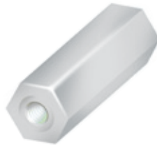
R40-100 Brass, Hexagonal M4, 7.0mm A/F