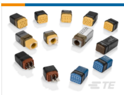
TE Part #ZPF000000000203708 DMC-M 99-10 PC