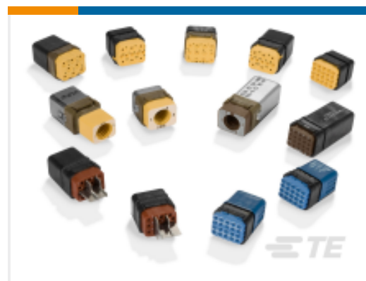
TE Part #ZPF000000000015141 DMC-M 01-08 AB