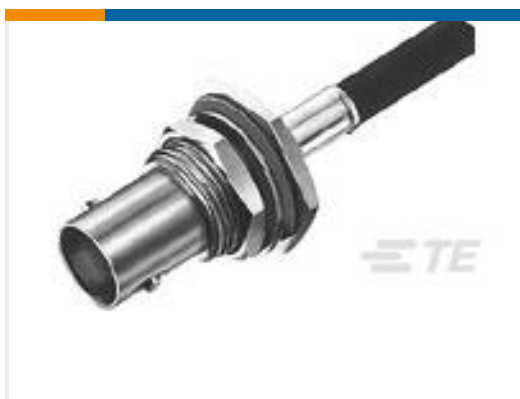
TE Part #225398-6 CONNECTOR, BNC DUAL CRIMP JACK