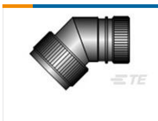
TE Part #CZ6862-000 HEX40-AC-45-25-A12-3