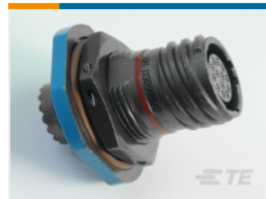
TE Part #YDTS24W19-35SNV001 RECP ASSY