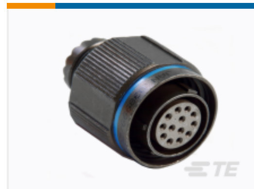
TE Part #YDTS26W13-98PNV001 PLUG ASSY