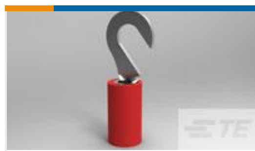
TE Part #32456 PIDG HK 22-16 COMM 22-18 MIL 8