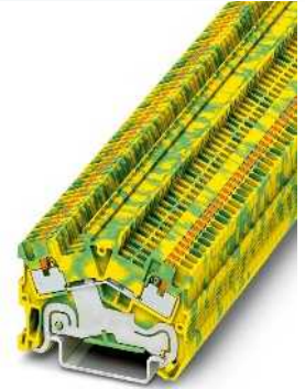
1.5 (1.5) mm 2 , ground terminal block, 2 connections