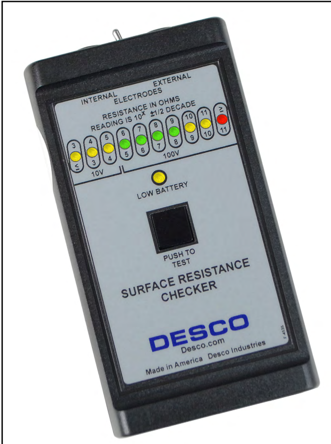
Figure 1. Desco 19640 Surface Resistance Checker