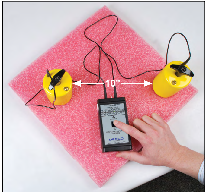
Figure 4. Using the 19641 test leads and 50003 five-pound electrodes to measure Rtt

Clean the material's surface for test lab measurements, but do not clean the surface for materials that are already installed. Only clean and re-test the installed material if failure occurs.