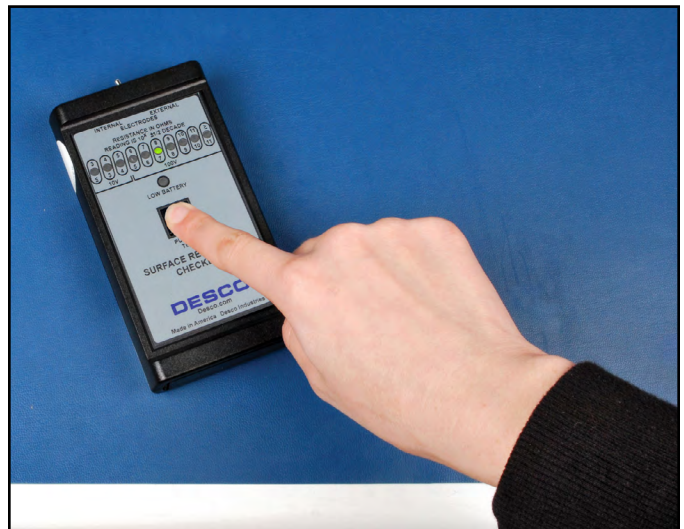
Figure 3. Using the parallel electrodes to measure surface resistance

If the measurement is outside acceptable limits, clean the surface with an ESD cleaner containing no insulative silicone such as Desco 10435 Reztore® Surface & Mat Cleaner, and re-test to determine if the cause of failure is an insulative dirt layer or the ESD worksurface material.