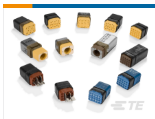
TE Part #ZPF000000000203708 DMC-M 99-10 PC