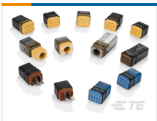
TE Part #ZPF000000000015141 DMC-M 01-08 AB