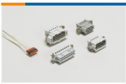
Rectangular Contact Inserts(111)