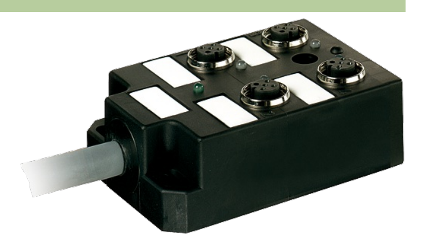
M12 Females 4-pole