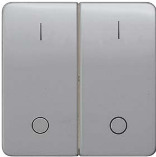
DELTA PROFIL, SILVER ROCKER W. SYMBOLS I0 F.PUSHB. 2FOLD CENTER POSITION 65X65MM