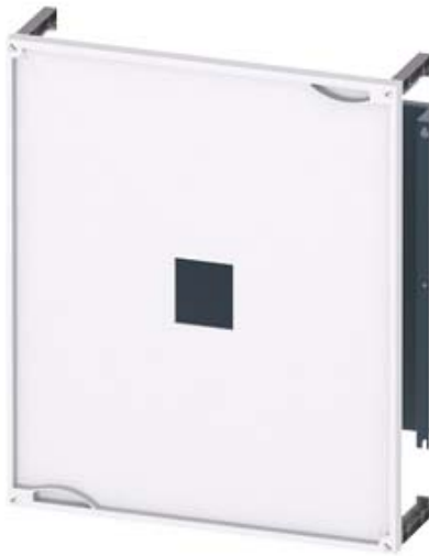
ALPHA 1600 DIN ASSEMBLY KIT F.3/4P-CIRCUIT BREAKER VL1250/1 H=600 W=500 D=400