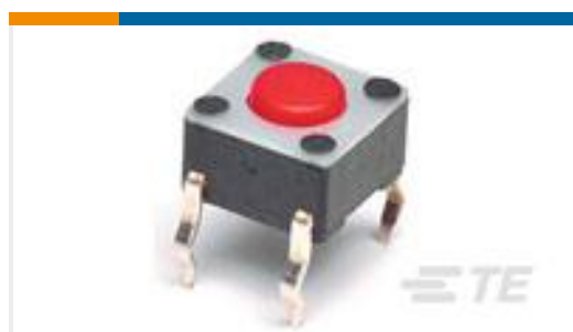
TE Model / Part # 2-1825910-7 FSM14JH=6MM TACT SWITCH, HIGH TEMP