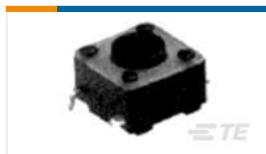
TE Model / Part # 3-1437565-0 FSM2JSMATR=ON T/R