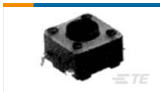
TE Model / Part # 4-1437565-2 FSM4JSMATR=TACT SWITCH 6X6MIL