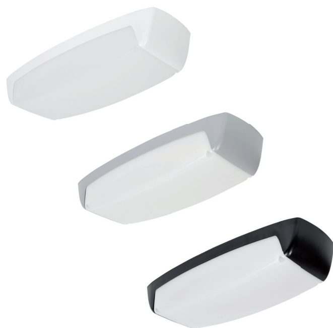
HBI Bisscheroux B.V. 4XL09-- 440 Fortem / LVK (polair)