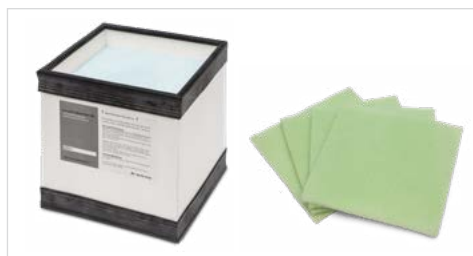
High-end filter materials, same filters for EASY ARM 1 and EASY ARM 2