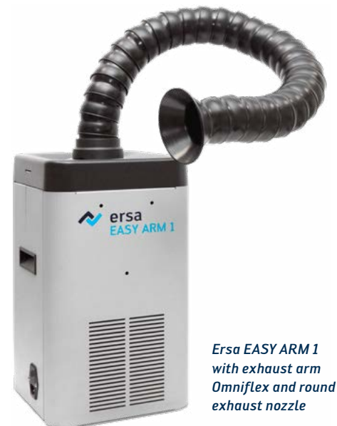
Ersa EASY ARM 1 with exhaust arm Omniflex and round exhaust nozzle

For energy saving purposes and to extend filter lifetime, both units can be connected with Ersa i-CON soldering stations or a standby switch. In this way, the extraction unit is only working whilst the attached soldering station is in operation, stopping as soon as the soldering station goes into standby mode.