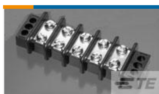
TE Part # 1546311-8 8P .563" DR BARRIER,W/WASHER