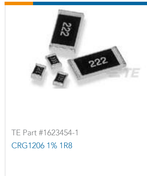
TE Part #1623454-1 CRG1206 1% 1R8