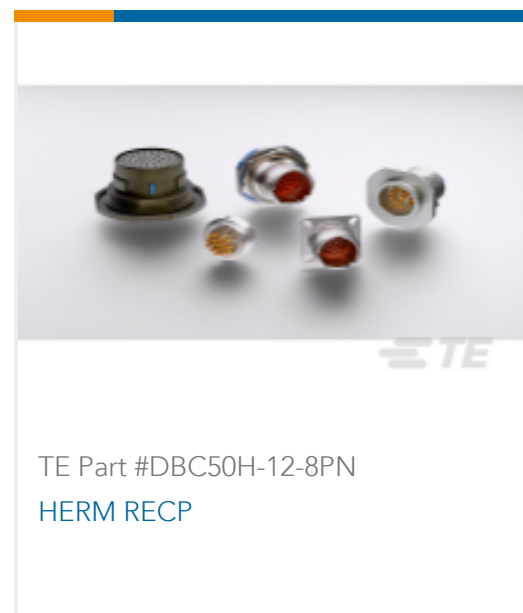
TE Part #DBC50H-12-8PN HERM RECP