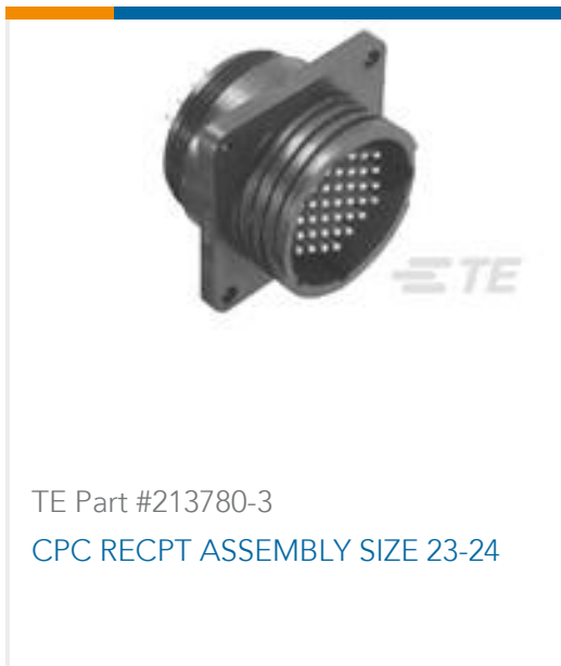
TE Part #213780-3 CPC RECPT ASSEMBLY SIZE 23-24