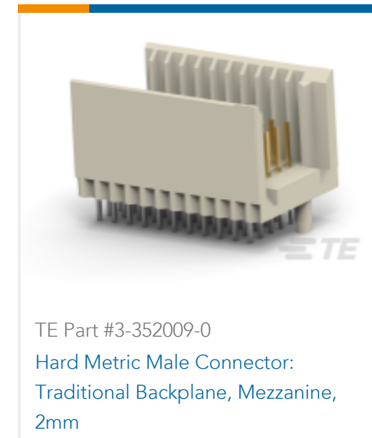
TE Part #3-352009-0 Hard Metric Male Connector: Traditional Backplane, Mezzanine, 2mm