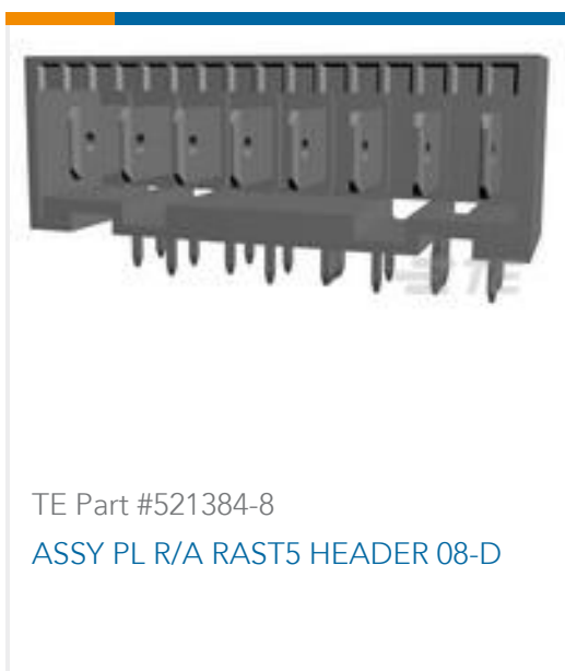
TE Part #521384-8 ASSY PL R/A RAST5 HEADER 08-D