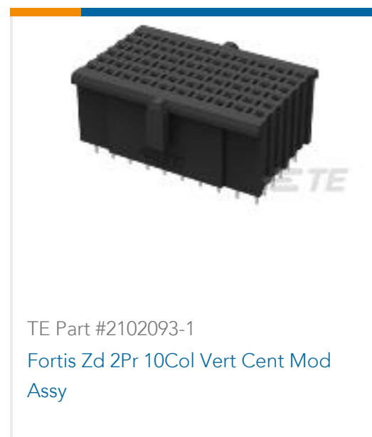
TE Part #2102093-1 Fortis Zd 2Pr 10Col Vert Cent Mod Assy