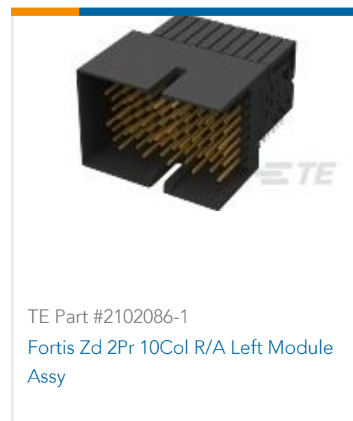
TE Part #2102086-1 Fortis Zd 2Pr 10Col R/A Left Module Assy