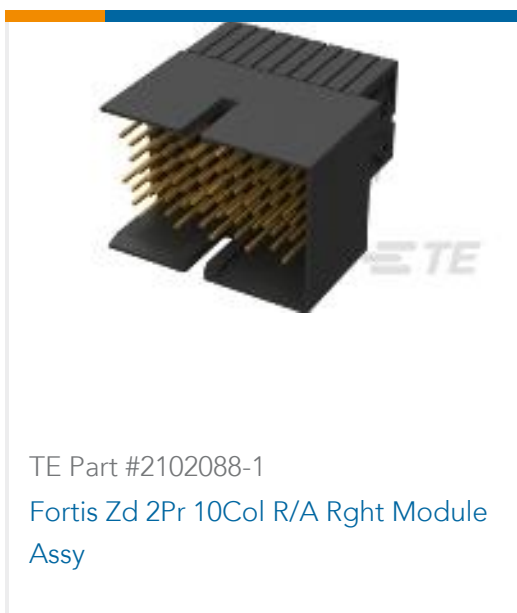
TE Part #2102088-1 Fortis Zd 2Pr 10Col R/A Rght Module Assy