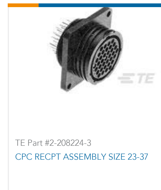
TE Part #2-208224-3 CPC RECPT ASSEMBLY SIZE 23-37