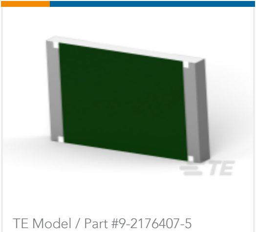
3560 100R 5%