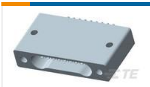
TE Part #1-1589457-3 SSL015SC2DC012N = WDUALOBE