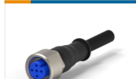
TE Part #2273045-4 M12 A-CODE FEMALE STRAIGHT PIGTAIL