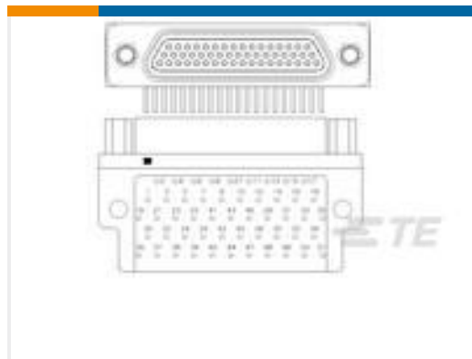
TE Part #1-1532264-2 M83513/14-G03NP = MCKS-N1-P- 51SRT1B