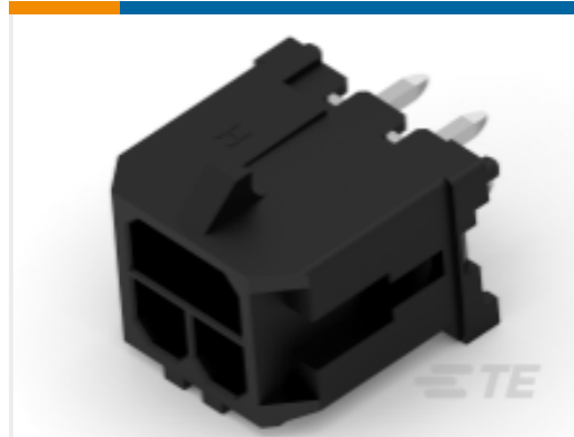
TE Part #1-2204801-8 ELCON MICRO,HEADER,VERTICAL DIP,4P