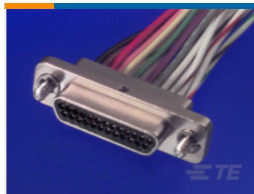
TE Part #1532177-7 M83513/04-G11N, MCKS-N1-B- 51S6Q9-18.0