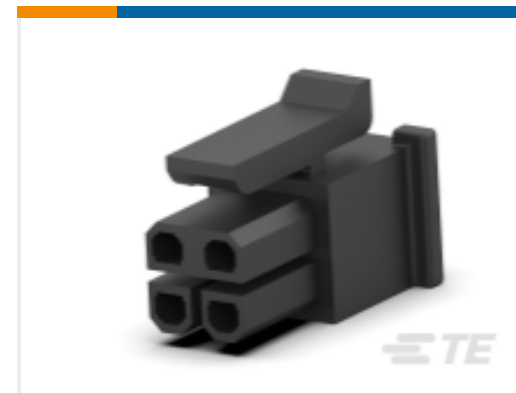
TE Part #2204748-2 ELCON MICRO,RECEPTACLE HOUSING,4P