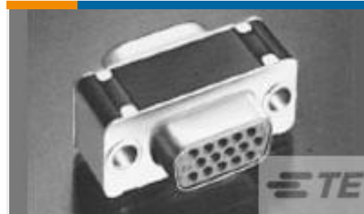
TE Part #211013-4 CONN SAVER,62 POSN,AMPLIMITE