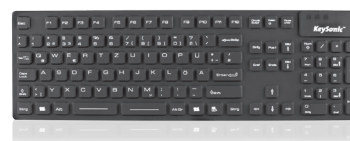
KSK-8030 IN Full-size Silicone keyboard for industrial use