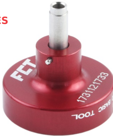
Positioner for D-Subs and High-Density Contacts