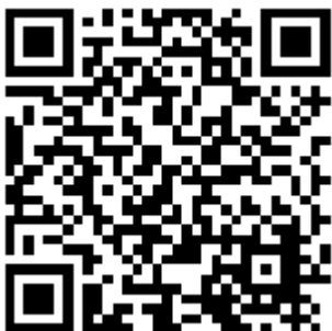
SCAN QR FOR PRODUCT PAGE

This part number has created a 3 metre duplex LC to SC OM4 LSZH patch cord in aqua.