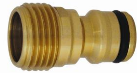
SI15143 / SI15144