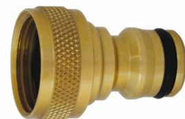
SI15140 / SI15141 / SI15142