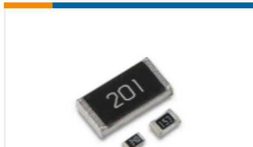
TE Part #1-2176325-5 CRGP 0402 150R 1%