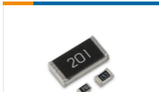
TE Part #2176325-5 CRGP 0402 22R 1%