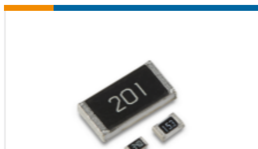
TE Part #2-2176330-1 CRGP 2010 470R 1%