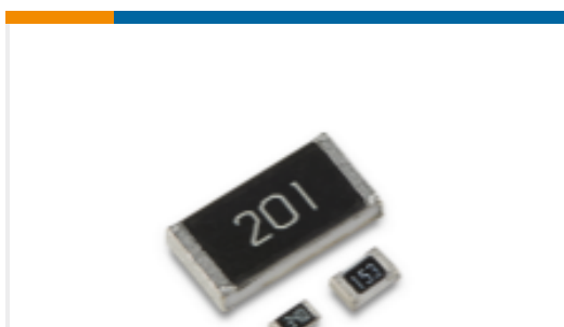
TE Part #2176330-1 CRGP 2010 10R 1%