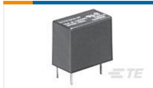
TE Part #1393194-9 T77S1D10-12