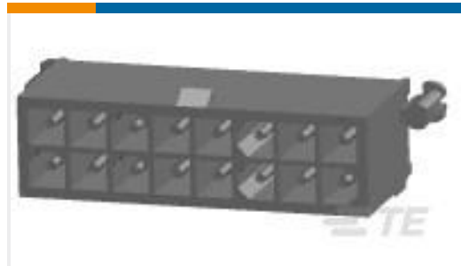
TE Part #1-794075-0 16P MINI UMNL HDR W/O DH SN