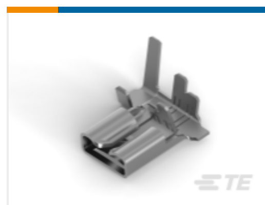
TE Part # 2238171-3 250 FASTON, FLAG, REC., 22-12 AWG, TPBR