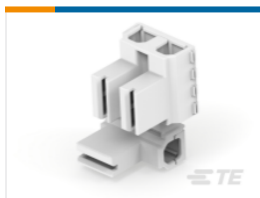
TE Part # 2238270-1 HSG, RECEPT, 250 FASTON FLAG, 3P, T9G

Also in the Series | Potter & Brumfield T9G