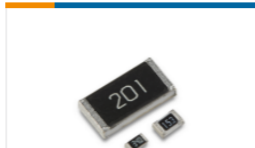
TE Part #5-2176328-7 CRGP 1206 470K 1%