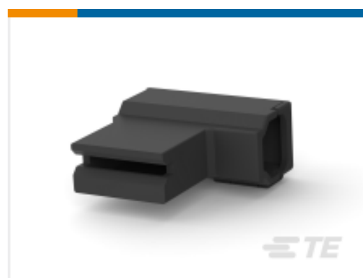
TE Part # 1969657-1 250 FASTON HSG., FLAG, REC., 1 POS, BLACK