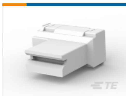
TE Part # 1969656-1 250 FASTON HSG., FLAG, REC., 1 POS, NATURAL