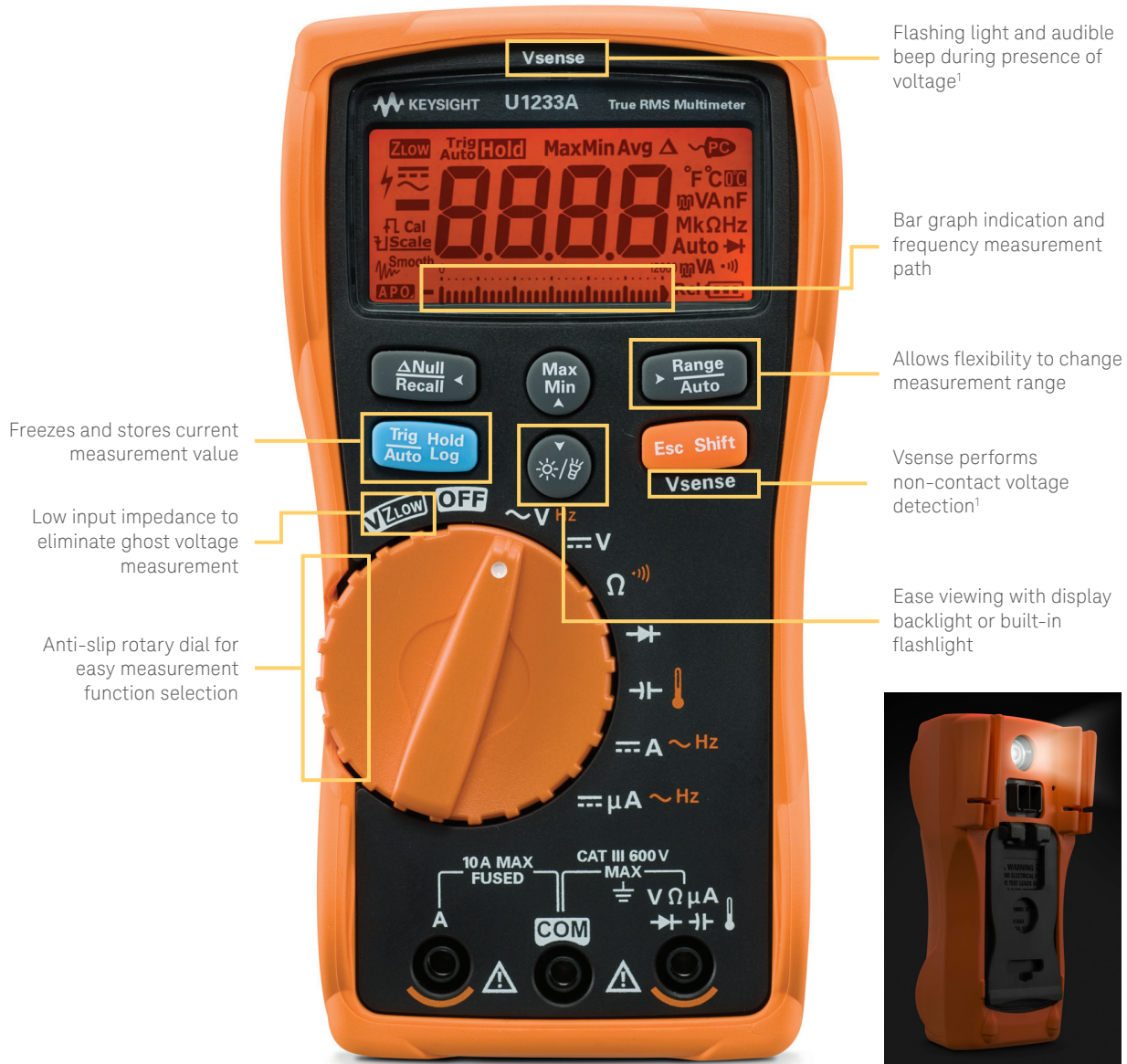
Figure 1. U1230 Series front view