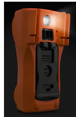
Figure 2. The built-in flashlight as illustrated