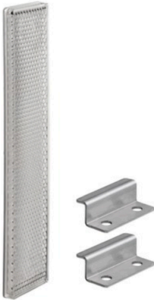
Part no.: 50130291 TK 40 x180.1-Set Reflector