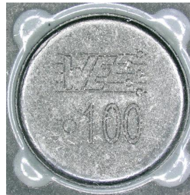
Marking with Laser Marking