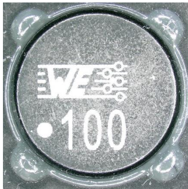
Marking with Pad Printing